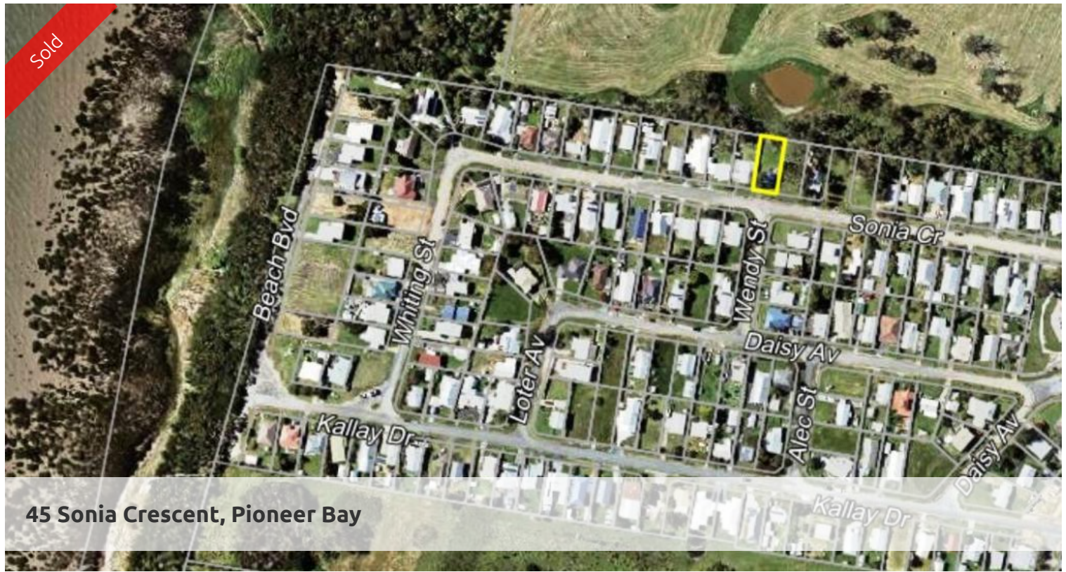
45 Sonia Crescent, Pioneer Bay