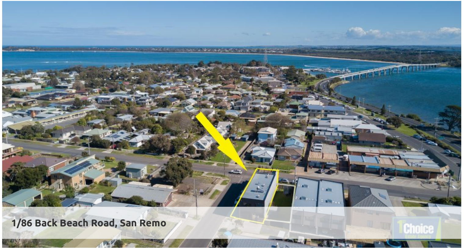
1/86 Back Beach Road, San Remo