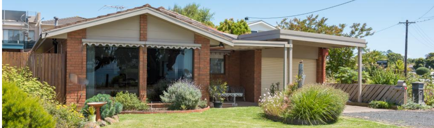
Unit 1, 28 Forrest Ave, Newhaven