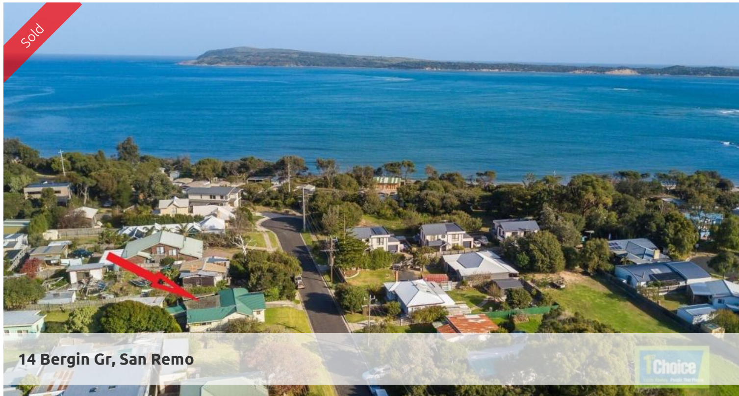
14 Bergin Gr, San Remo

1st Choice Estate Agency People That Please