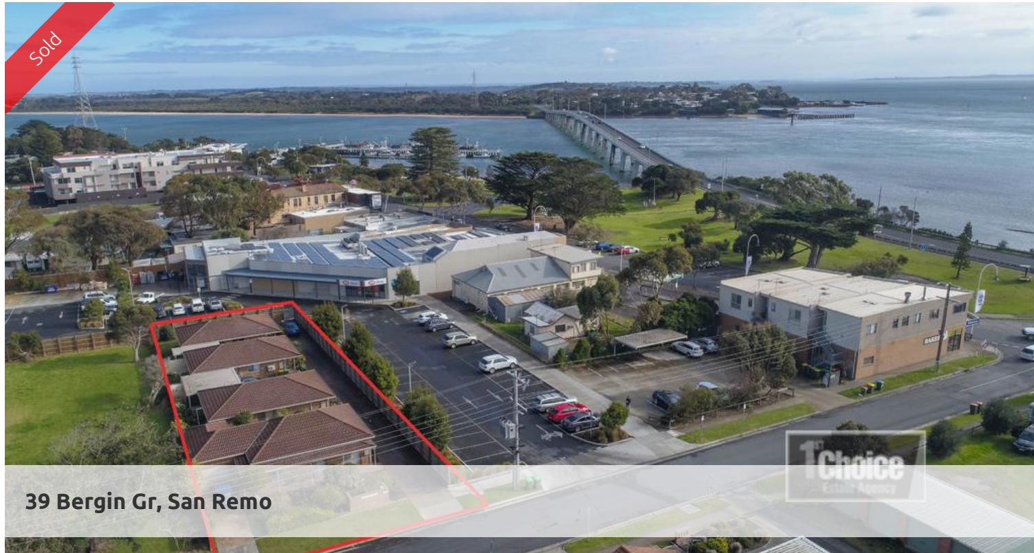
39 Bergin Gr, San Remo