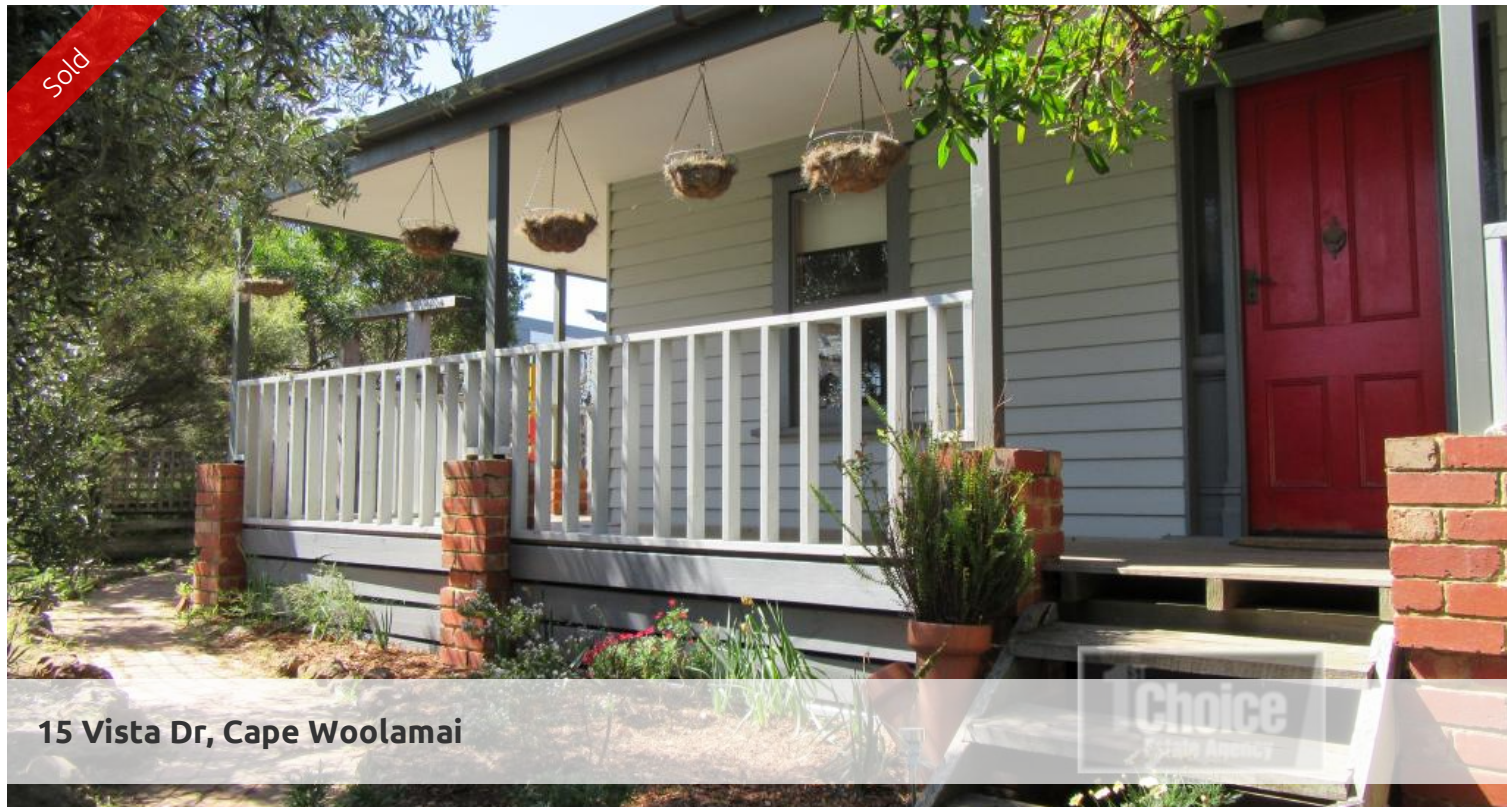
15 Vista Dr, Cape Woolamai